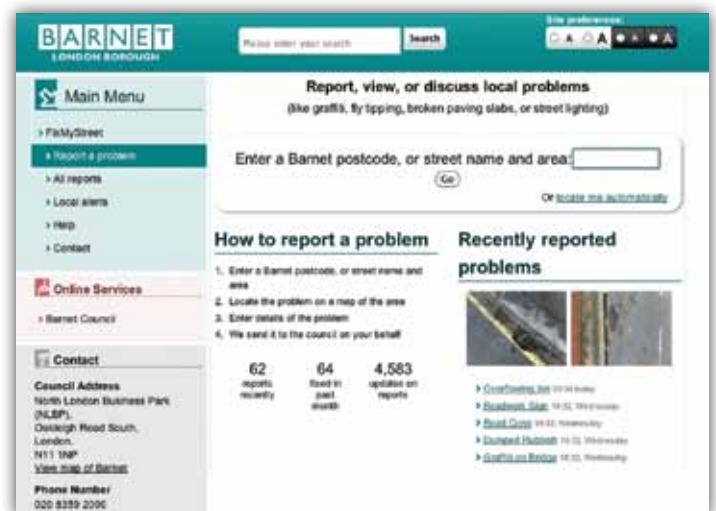
London Borough of Barnet FixMyStreet page

If you'd like additional features we will work with you to adapt the solution to your needs.